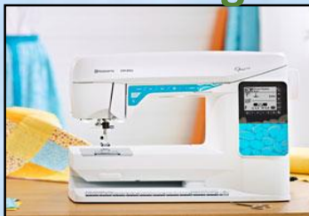
Click to learn about the Opal 670