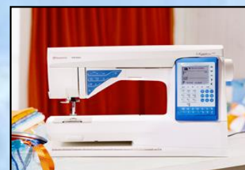
Click to learn about the Sapphire 930