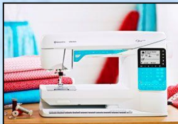
Click to learn about the Opal 650