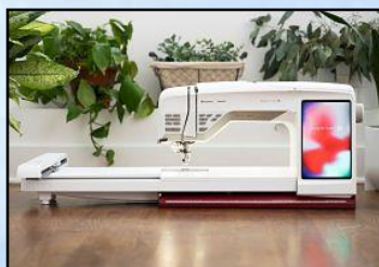
Click to learn about the Ruby 90