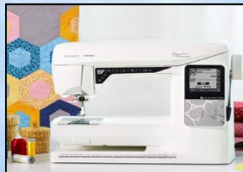
Click to learn about the Opal 690Q