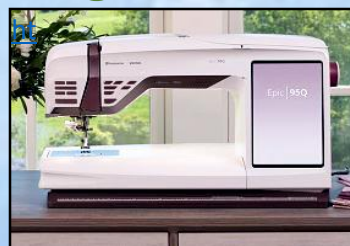
Click to learn about the Epic 95Q