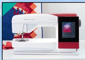
Click to learn about the Brilliance 75Q