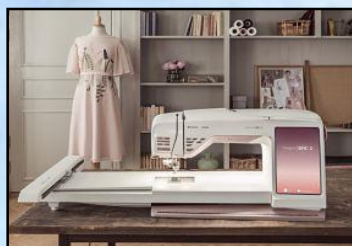
Click to learn about the Epic 2